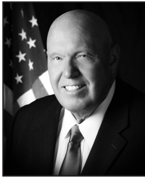
MAYOR GARTH O. GREEN